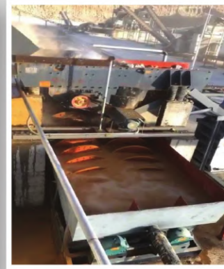
Barite Jigging Plant at Khuzdar