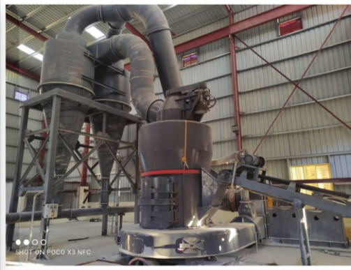
Grinding Mill at Khuzdar