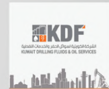
KUWAIT DRILLING FLUIDS