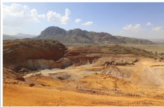
Barite Mine site, Khuzdar