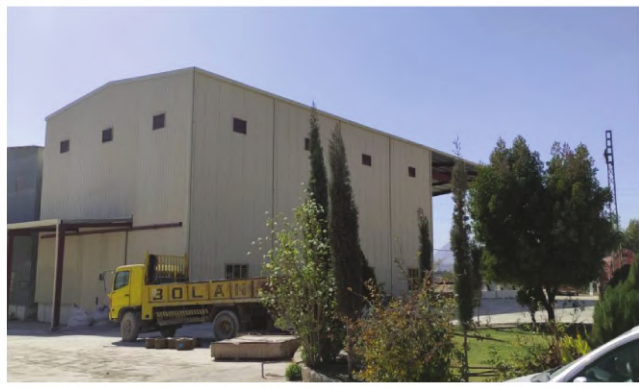
BME Grinding Facility, Khuzdar